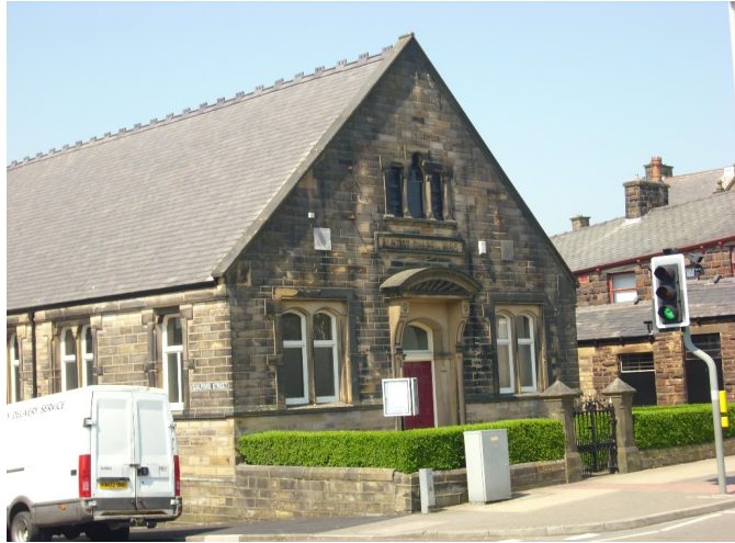
Brierfield Baptist Church, Brierfield, BB9 5LH