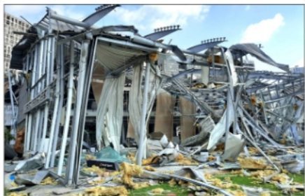
You stood with the people of Beirut. And you made a difference.

At least 200 people were killed in a massive blast that decimated the port area of Lebanon's capital Beirut on 4 August 2020.