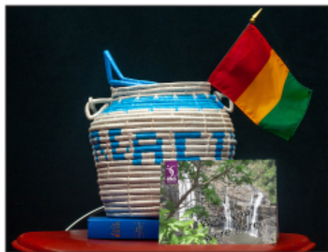
Is God calling you to serve in Guinea?

Some were murderers. Some were thieves. Some were victims held without trial. Fifty-five men shared one cell: dirty, cramped and forgotten. Forgotten by everyone, except for Ben.