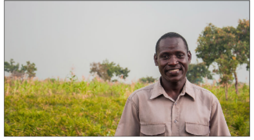
You can support a life-transforming project in northern Uganda, and help fight against climate change while you do it!