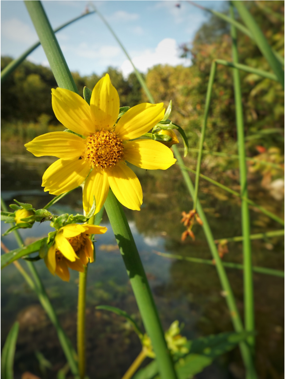
Nodding bur marigolds by David Whelan [CC0], via Wikimedia Commons