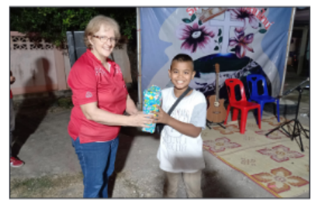
Sharing God's love on Valentine's Day in Thailand!