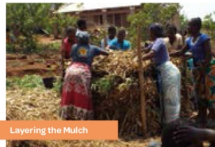
Layering the Mulch

Another aspect of conservation agriculture was the process of zero tillage. Instead of indiscriminate ploughing of soil before planting seeds, which can badly affect the water content of the soil, this method encourages just the making of holes at the point where the seeds are to be sown. Compost is put at the bottom of the hole before the seeds are sown which are then covered with soil and watered.