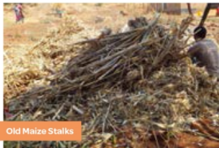
Old Maize Stalks

In Mphemba, just outside Blantyre farmers gathered together for hands-on training. Chopping up the maize stalks took a lot of work and the men took it in turns to wield their machetes. When enough mulch was ready everyone was gathered round an oblong area of ground which had been cleared and marked out by poles. Gradually layers of maize mulch, old soya roots, green leaves and then a thinner layer of chicken manure were laid on top of one another. Before every handful was laid however, it was thoroughly soaked in water.