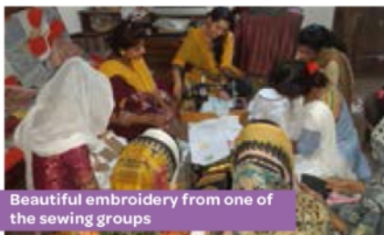
Beautiful embroidery from one of the sewing groups

For these reasons, Light for the Nations (LFTN) started providing skills training for poor women, mostly, but not exclusively, Christian.