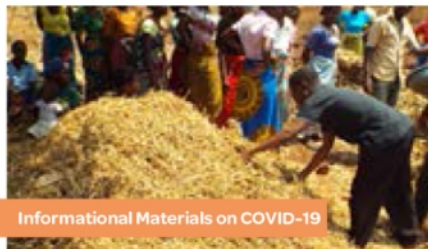
Informational Materials on COVID-19

Everyone had their go at applying the 'rubbish', making it a very good, hands-on, co-operative exercise. After three hours, the compost heap stood about five feet high in one half of the area prepared for it. This was now left for about seven weeks. Then it would be 'turned' over into the other half of the prepared area. Remember that this is the tropics and so the compost will have matured well by this time.